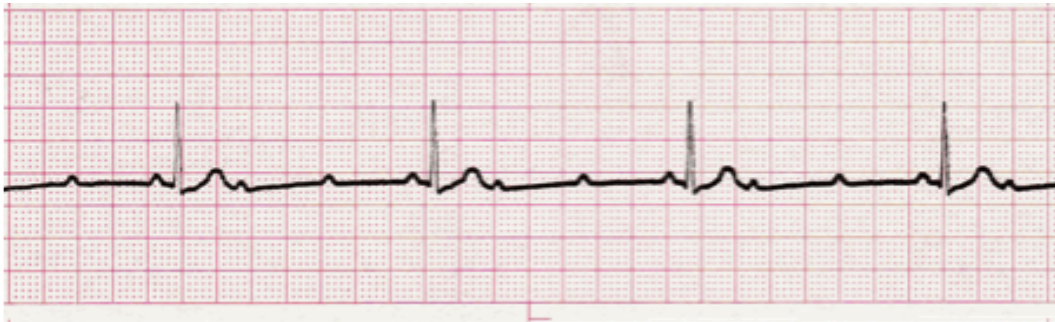
DIAGRAM # 4